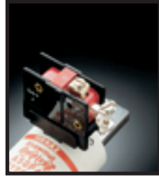
AOS-S Mounted on fuse