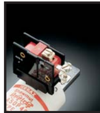
AOS-S Mounted on fuse